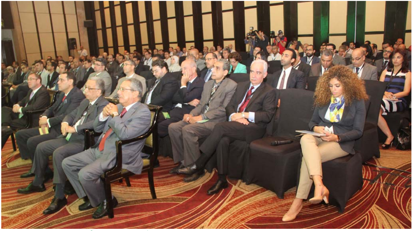
ICEC 2015 – Cairo Conference Attendees

These were attended by the most influential real estate investors, developers, city planners, consultants, technology providers, architects, designers, government and telecoms authorities, systems integrators as well as contractors and building material providers.